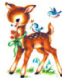
Standing on the corner of Deer Hollow Drive & RR 2831 in APRIL , watching the Bluebonnets bloom!

IN SPITE OF A SIGNIFICANT LACK OF RAINFALL late last winter and early spring, PLUS an unusually harsh deep freeze in early March, those hardy BLUEBONNETS hung in there and put on a fantastic show for us last season! Even starting a bit early in mid March, roadsides of Hwy 71, RR 2147 and RR 2831 were lined with masses of the flowers, with WHITE PRICKLY POPPIES sprinkled in the mix, to make this last springtime a great time to be out on the roads! Our favorite WILLOW CITY LOOP drive was breathtaking!! The big March freeze didn't seem to bother any of them after all. They are indeed... tough little Texans! Not to be outdone, millions of MEXICAN BLANKETS, INDIAN PAINTBRUSH, MEXICAN HATS and COREOPSIS followed the BLUEBONNETS to make this last Spring - 2019 such a SPECTACULAR one for all of us to remember!!