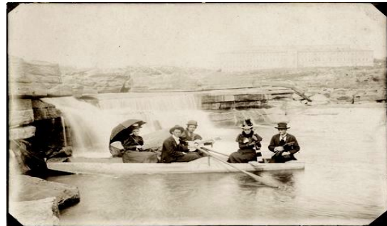
Original "Falls" circa 1900