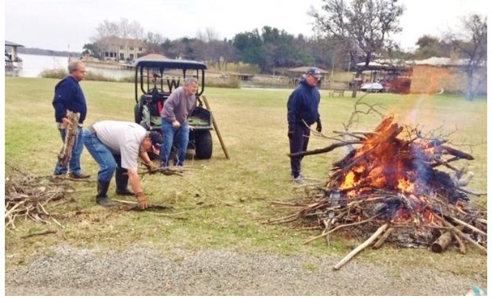
Disposal of Flood Debris....Feb. 16, 2019