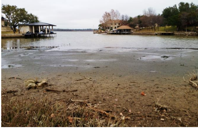
October Flood Debris.....Jan. 2019

It was a YUCKY job....but somebody had to do it. And do it they did! The seven volunteers braved the messy shoreline at the park and gathered the leftover debris from the October floods while the lake was still down!