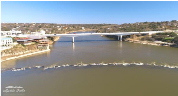
Original "Falls" showing while Lake is down....2019

Lake Marble Falls was lowered to 7 feet below its normal stage of 738 and is STILL in draw-down stage and 58% full. The refill of Lake Marble Falls will start on March 18 and end on March 21. Presently some of the tops of the original 'FALLS' have been uncovered by the draw-down and can be seen from the HWY 281 bridge. (See pics below.) The purpose of the draw-downs was to allow lakeside business & private property owners the opportunity to work on the repair and cleanup of their waterfront amenities. In that way, docks and other waterfront structures that had been flood damaged or washed away in the October 2018 flood could be repaired or replaced while the water level was down. Also there was a great deal of submerged flood debris at the shorelines of both lakes that needed to be removed and the draw-downs allowed the owners to identify the debris, remove it and clean these areas.